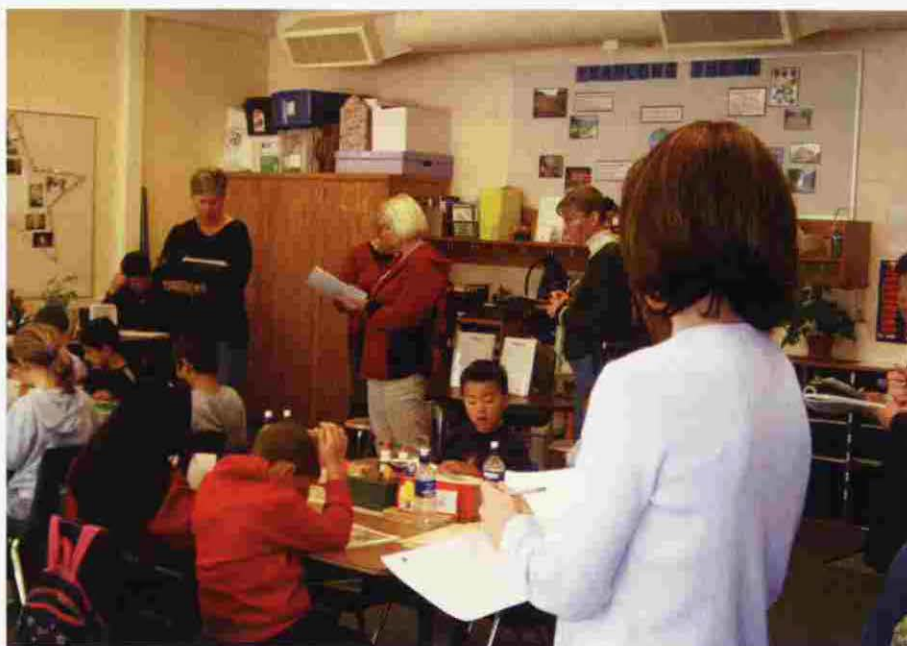
Members of a lesson study team observe a class and collect data.